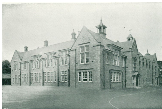
BOYS' SCHOOL—SOUTH FRONT.

September 1915: The Girls' Grammar School opens in the north wing of the new school building.